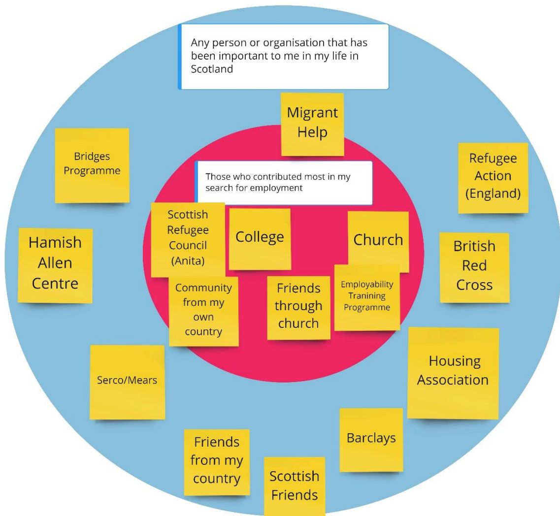
Figure One: Connections deemed important to life in Scotland

Advice from the wider team at Scottish Refugee Council was recognised too, as regards people finding out about their housing rights, and assisting with the transition after being recognised as refugees and being granted leave to remain. While participants were all fluent speakers of English and so unlikely to have been referred to Workers’ Educational Association, several spoke warmly too of Bridges Programmes as a key connection that had helped with their employability.